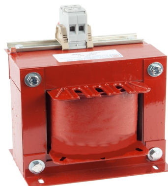
DC link choke

These custom-built three-phase DC link chokes are connected between the rectifier and the DC bus and can be used to remove unwanted harmonics. They can be more or less effective than AC line reactors depending on the harmonics in the line and they add the necessary impedance for harmonic reduction without a drop in voltage. DC link chokes can also protect against current surges. Units can be produced to customers' own drawings and requirements.