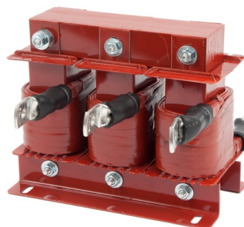
3ph output choke

Designed to customer requirements using either our standard design or customers' own drawings or specifications.