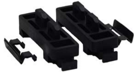
GA 35 DIN rail adaptor

IP55 filter fan protection hoods to EN60529/10:91.