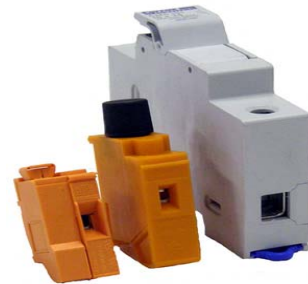
Transformer fuse options