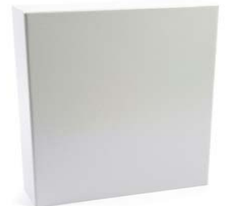
PH20 IP55 cover