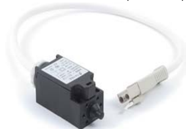
LK4315 door switch

Filter fan or exhaust filter hoods to increase IP protection from IP54 to IP55. Supplied in steel and finished in powder coating to RAL 7035.