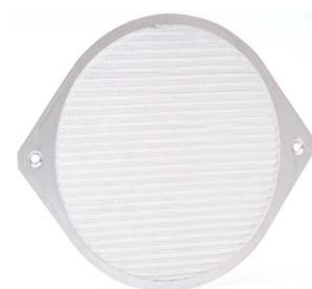
MMG metal mesh guard