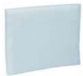
FM 80 replacement filter